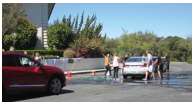
A free car wash and service with a smile